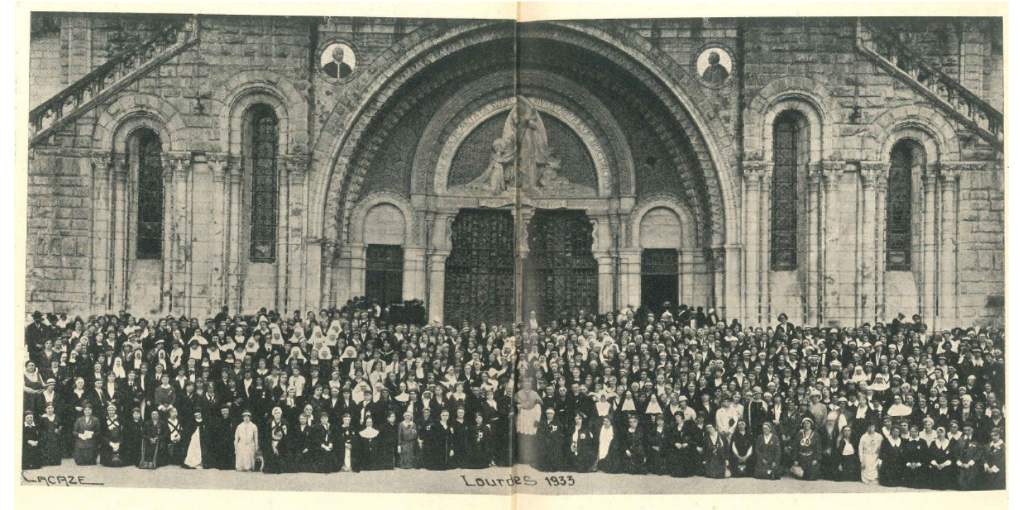
UCZESTNICZKI MIĘDZYNARODOWEGO KONGRESU PIELĘGNIAREK KATOLICKICH PRZED GŁÓWNA BAZYLIKA W LOURDES.

"...You who live in permanent contact with suffering, you who may so easily fall into doubt witnessing the terrible devastation caused by sickness, listen to Our Lady. She will teach you that suffering has its providential, irreplaceable significance in the world.