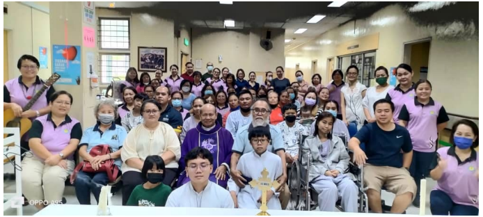
Members in Miri organized mass for patients at Miri Hospital on 24.02.24