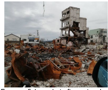
Famous fish market after untouched big fire in early April 2024