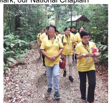
Reciting the Rosary

This is the event where Catholics nurses and other allied health professional from all over Malaysia get together.