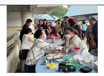
Members in Bau conducted the health screening after mass 28.01.24