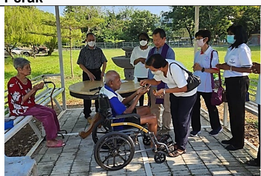
CNG Taiping visiting the elderly and homebound on 18.03.24