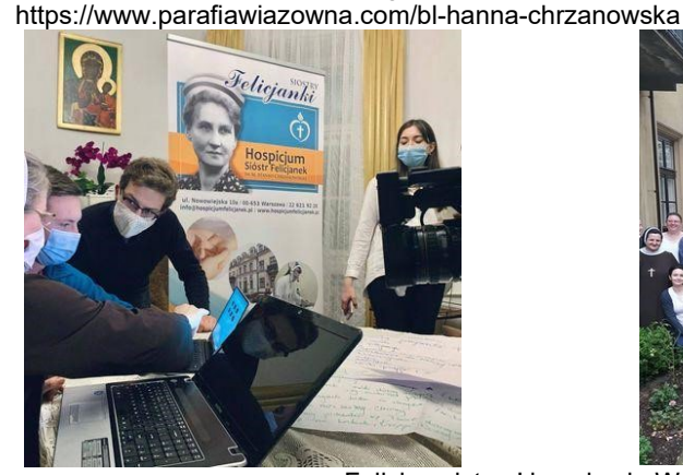
Felician sisters' hospice in Warsaw, with both sisters and volunteers