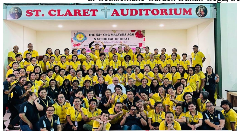
Some of the participants

The 52<sup>nd</sup> CNGM AGM and Retreat held on 28 September to 1 October 2023 at Gethsemane Garden Bunan Gega, Serian in the State of Sarawak