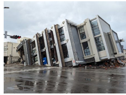
Damage to the urban area in Noto, January 27, 2024

On April 3rd, another large earthquake occurred in Taiwan. We will be able to exchange information and pray for each other in the event of a disaster.