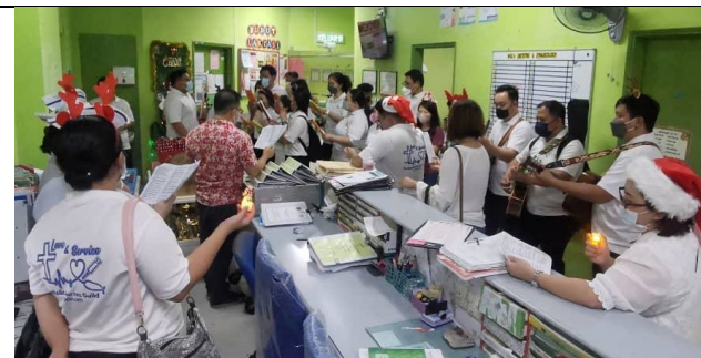
CNG Labuan organized Christmas Carols in the hospital