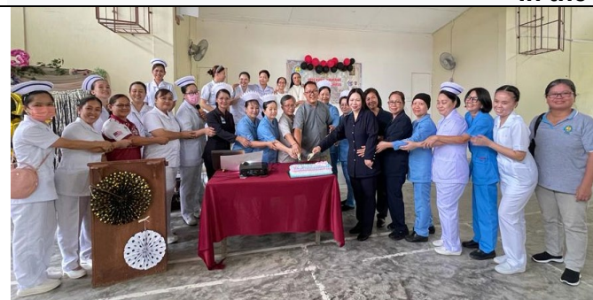
CNG Kiulu celebrating IND and mass service on 28.05.23. The members had a meeting with CNGM's President.