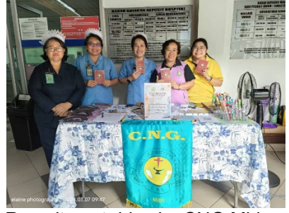
Recruitment drive by CNG Miri on 11.03.24