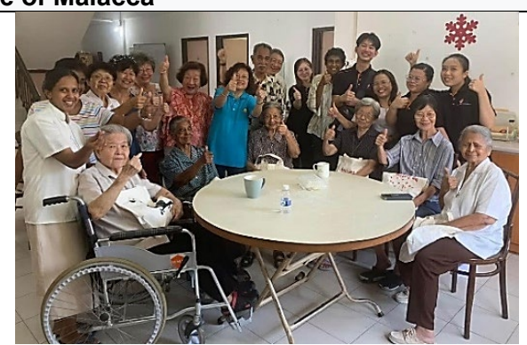
CNG Melaka. A moment with the retired Sisters

Since the mco was up-lifted, we are back in full force. We are multi-tasking. In addition, being a carer, we are the cleaner, gardener, teacher or the cook, etc. when there is in need. From time to time we are also called to attend a meeting at our Parish Office especially when it's related to pastoral care. We will continue to serve God and care for those around us.