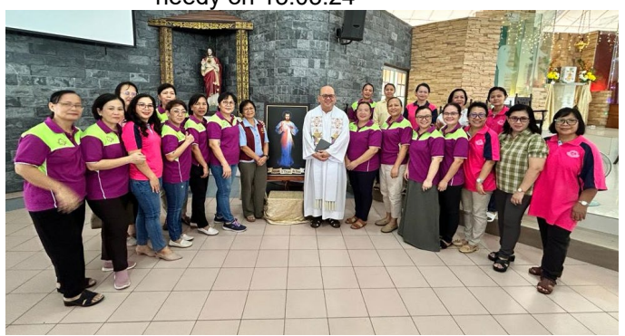
A mass service for health care workers led CNG Serian on 06.04.24