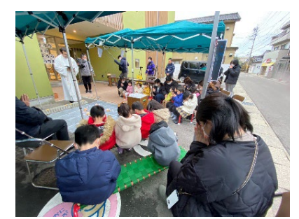
Memorial prayer in front of a Catholic kindergarten affected area, January 27, 2024