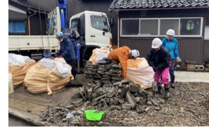
JCNA members helping clean up the disaster area in early April 2024

More than 7,400 people are forced to live in evacuation centers set up by cities and towns in Ishikawa Prefecture. This is less than one-fourth of the