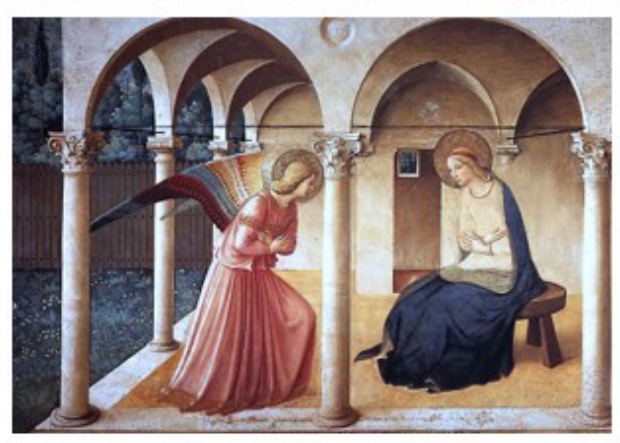
Fra Angelico, San Marco: Annunciation

Wednesday, May 1 2024 7:00 pm to 8:30 pm EDT