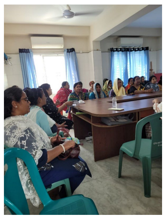
Nurses at the Lenten Retreat St. John Vianney Hospital Tajaon, Dhaka, Bangladesh