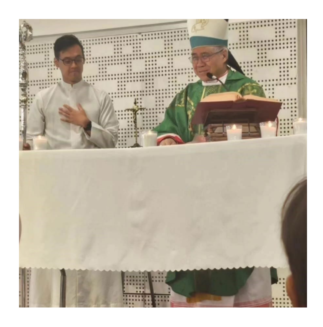
Catholic Nurses Guild of Singapore at the annual Social Mission Mass at Agape Village in Toa Payoh January 13, 2024