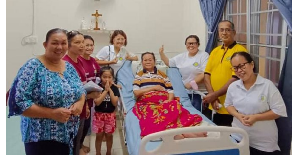
CNG Labuan visiting sick members