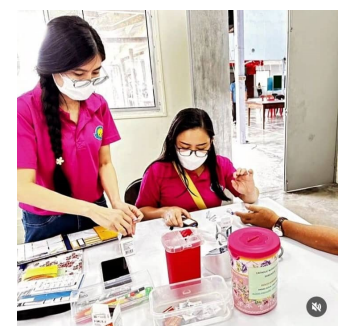
Health screening by CNG Sandakan on 29.01.24

Catholic Nurses Guild of Sandakan conducted a Blood Donation Campaign on March 17, 2024 to help thalassemia patients and raise awareness about blood donation, part of their mission to follow in the footsteps of Jesus.