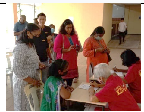
CNG Taiping involved with the Cancer Screening and HPV Vaccination Program on 17.03.24