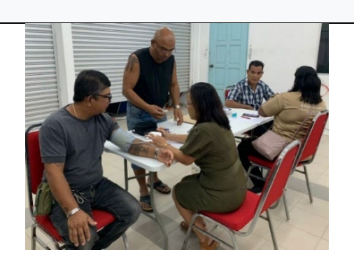
Members organised health screening