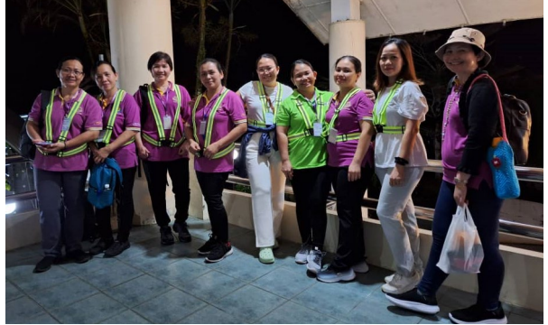
Medic Standby Team in Bau for the Lenten Walk on 16.03.24